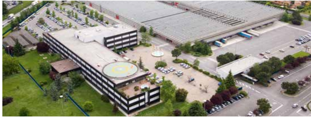
GEWISS HEADQUARTER - ITALY

GEWISS IS AN INTERNATIONAL LEADER IN THE PRODUCTION OF SYSTEMS AND COMPONENTS FOR LOW VOLTAGE ELECTRICAL INSTALLATIONS. CONTINUAL INVESTMENTS IN RESEARCH AND DEVELOPMENT, TRAINING FOR ALL PERSONNEL AND EXPANSION OF PRODUCTION FACILITIES HAVE ENABLED GEWISS TO BECOME A KEY PLAYER ON THE MARKET, MANUFACTURING SOLUTIONS FOR DOMOTICS, ENERGY AND LIGHTING. BESIDES ITS HOME AND BUILDING AUTOMATION AND VIDEO COMMUNICATION SYSTEMS, THE GEWISS CATALOGUE INCLUDES ENERGY DISTRIBUTION AND PROTECTION SYSTEMS, AS WELL AS URBAN, RESIDENTIAL, STREET, INDUSTRIAL AND EMERGENCY LIGHTING SYSTEMS. ESTABLISHED IN 1970, FOLLOWING A REVOLUTIONARY IDEA ABOUT THE USE OF TECHNOLOGY IN ELECTRICAL SYSTEMS, GEWISS NOW SUPPLIES AN INTEGRATED ELECTRICAL SYSTEM COMPRISING MORE THAN 20,000 PRODUCTS, TO CATER FOR ALL NEEDS OF THE ELECTROTECHNICAL MARKET IN THE RESIDENTIAL, INDUSTRIAL AND COMMERCIAL SECTORS.